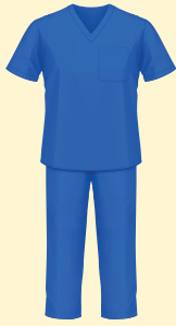
RN Royal Blue

To help you easily identify the role of people on your care team, our uniforms are color-coded. Here are some of the common uniforms and colors you will see.