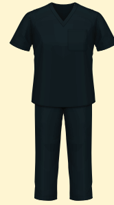
Dietary Staff Black