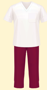
Allied Health Support Staff Maroon pants; white top