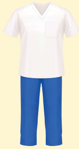
Nursing Support Staff Royal blue pants; white top