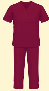
Allied Health Licensed/Registered Staff Maroon